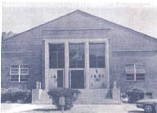
SPAULDING GYM 1948

Was first called the University Church and erected in 1948. The structure was made possible through the generous contributions of northern and southern church groups of both races. The church was rebuilt in 1955 and cost over $300,000 with a seating capacity of approximately 550. Today the chapel houses the offices of the Dean of the Chapel and seminar rooms.