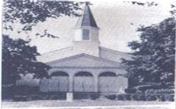
THOMAS BOYD 1948