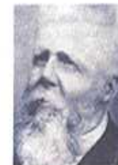
Dr. Henry Martin Tupper , Founder 1865

The Leonard Building was formerly called the Leonard Medical Building. It was built in 1871. After the Medical School was closed in 1918, renovated in 1942 and serves as a classroom building and headquarters for the General Baptist State Convention. The building was renovated again in 2000 and serves as a classroom and faculty office complex.