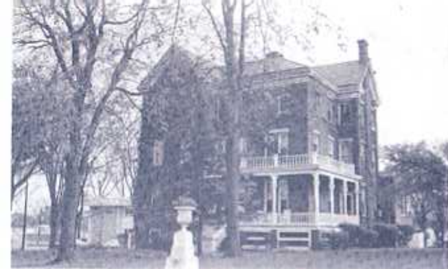
MESERVE HALL 1896