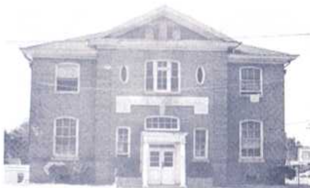
TUPPER HALL 1906